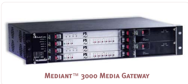
MEDIANT™ 3000 MEDIA GATEWAY

The Mediant 3000 is a feature rich, highly available VoIP Media and transcoding gateway supporting low to medium channel densities. The Mediant 3000 compact footprint meets the needs of Service Providers that deploy a geographically dispersed network. The Mediant 3000 offers robust high availability architecture, meeting the most stringent availability requirements of current Service Providers worldwide. Supporting Megaco, MGCP, TGCP and SIP, the Mediant 3000 can be deployed with different Softswitches. The capacity of the 3000 can scale from 480 channels up to 2016 Low-Bit-Rate channels, with a simple software upgrade and with a very small footprint of 2 Rack Units. The Mediant 3000 is a truly converged platform that suits wireline, wireless (GSM, UMTS, CDMA), Cable, IMS and Fixed-Mobile-Convergence applications.