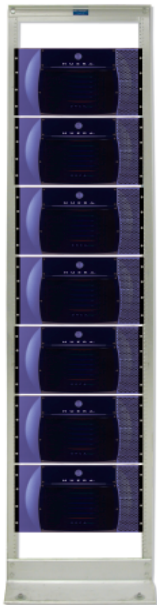
RDT-8v rack view