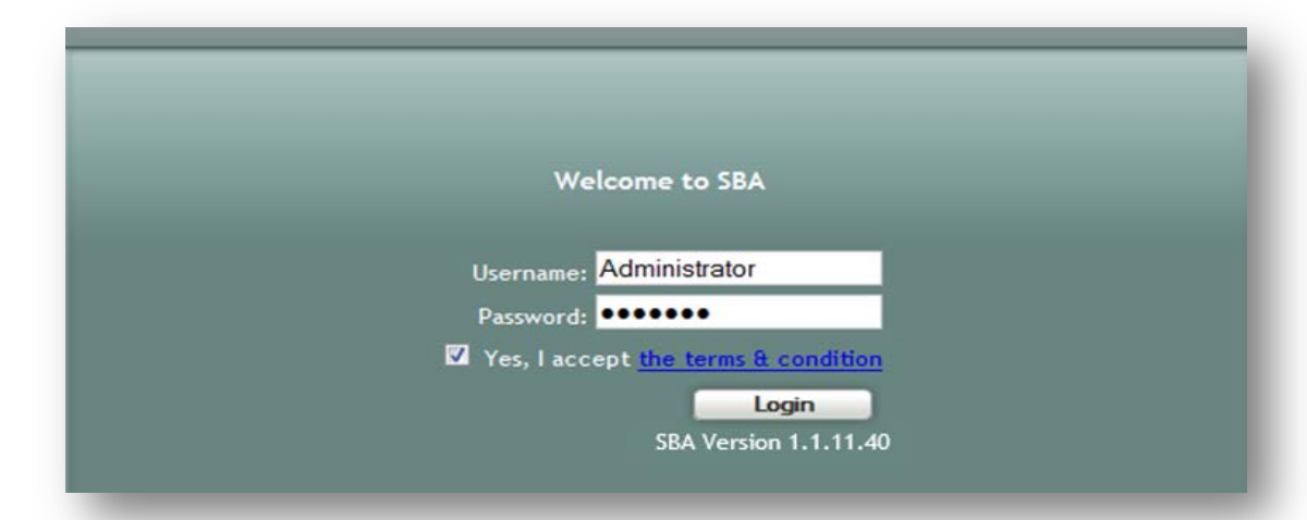
Figure 5-1: Survivable Branch Appliance Login Screen

3. Refer to the relevant Mediant 800 SBA for Lync Server Installation Manual document for configuring the SBA.