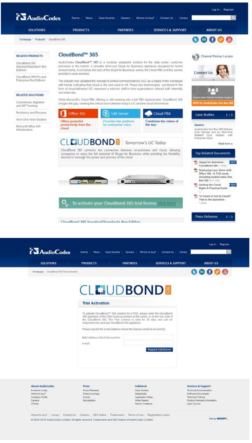
Figure 2-2: Obtaining a Trial License