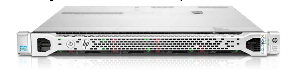
Figure 1-1: CloudBond 365 Pro / Enterprise Box Edition

Throughout this guide, AudioCodes CloudBond 365<sup>™</sup> will be referred to as CloudBond 365.